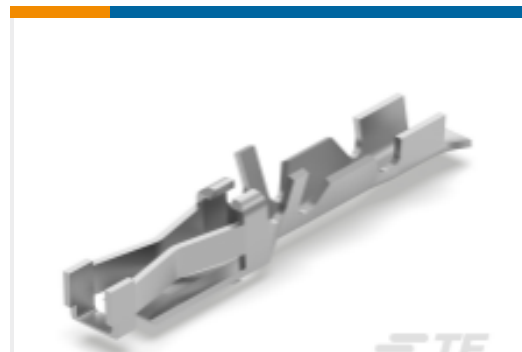
TE Part #927985-1 TELFIX KONT F828172