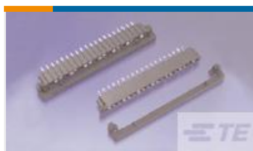
TE Part # 5-120628-8 LOCKING TRIOMATE ASY 8P(L)LDFR