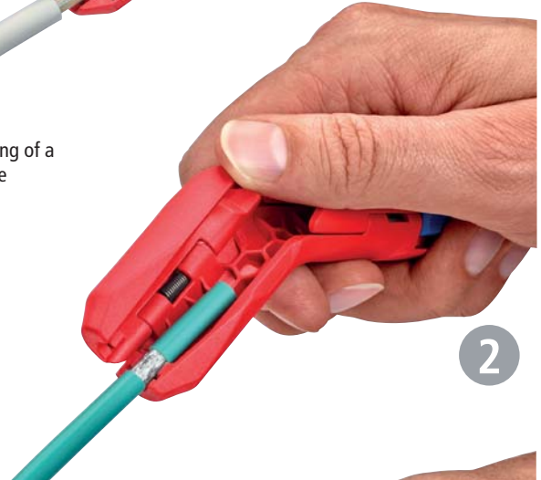
Dismantling of a data cable