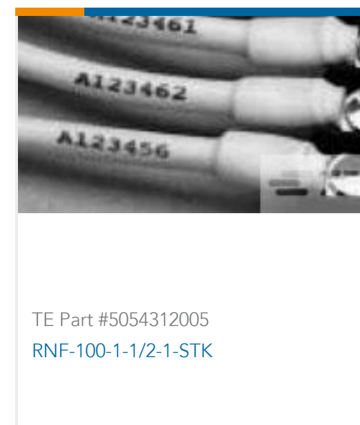
TE Part #5054312005 RNF-100-1-1/2-1-STK