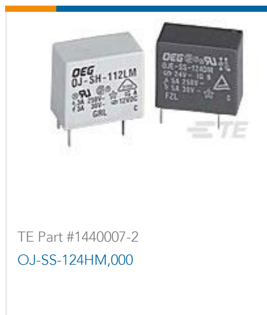
TE Part #1440007-2 OJ-SS-124HM,000