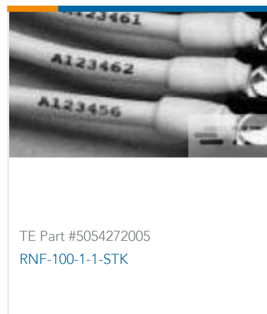
TE Part #5054272005 RNF-100-1-1-STK