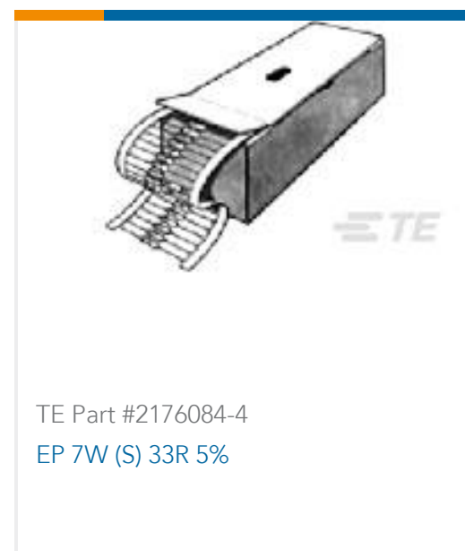
TE Part #2176084-4 EP 7W (S) 33R 5%