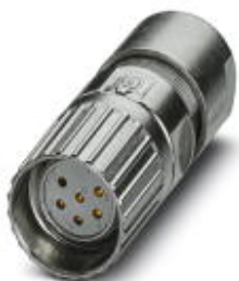
Cable connector, M23 PRO, straight, shielded: yes, Screw locking, M23, No. of pos.: 6, type of contact: Socket, Crimp connection, cable diameter range: 3 mm ... 15 mm

Please be informed that the data shown in this PDF Document is generated from our Online Catalog. Please find the complete data in the user's documentation. Our General Terms of Use for Downloads are valid ( http://phoenixcontact.com/download )