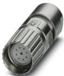
Cable connector, M23 PRO, straight, shielded: yes, Screw locking, M23, No. of pos.: 8+1, type of contact: Socket, Crimp connection, cable diameter range: 3 mm ... 15 mm

Please be informed that the data shown in this PDF Document is generated from our Online Catalog. Please find the complete data in the user's documentation. Our General Terms of Use for Downloads are valid ( http://phoenixcontact.com/download )