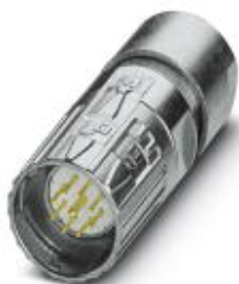
Cable connector, M23 PRO, straight, shielded: yes, ONECLICK fast locking system, M23, No. of pos.: 8+1, type of contact: Pin, Crimp connection, cable diameter range: 3 mm ... 15 mm

Please be informed that the data shown in this PDF Document is generated from our Online Catalog. Please find the complete data in the user's documentation. Our General Terms of Use for Downloads are valid ( http://phoenixcontact.com/download )