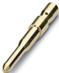
Crimp contact, turned, contact diameter: 1.5 mm, crimp range: 0.08 mm 2 ... 0.22 mm 2

Please be informed that the data shown in this PDF Document is generated from our Online Catalog. Please find the complete data in the user's documentation. Our General Terms of Use for Downloads are valid ( http://phoenixcontact.com/download )