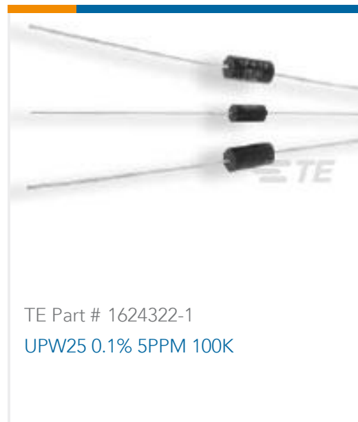
TE Part # 1624322-1 UPW25 0.1% 5PPM 100K