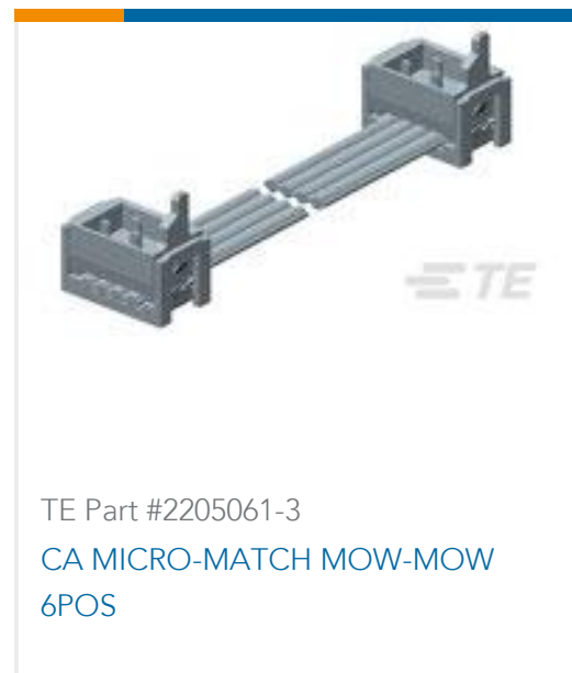
TE Part #2205061-3 CA MICRO-MATCH MOW-MOW 6POS