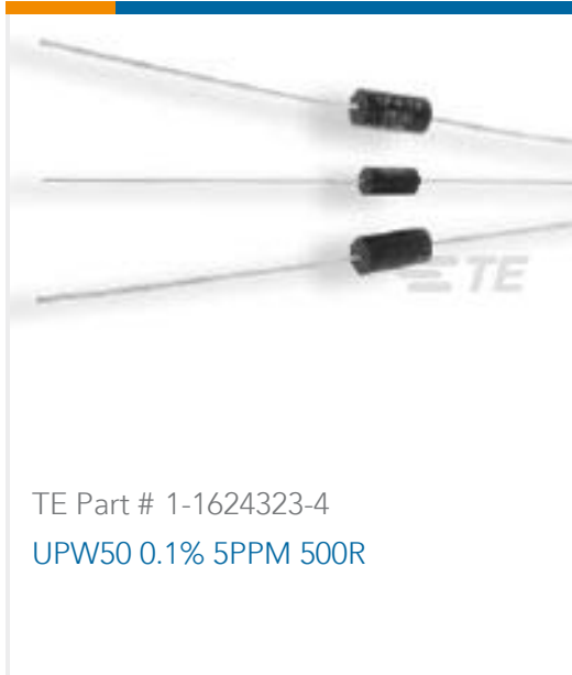
TE Part # 1-1624323-4 UPW50 0.1% 5PPM 500R