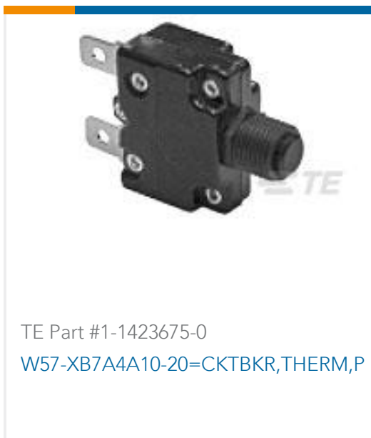
TE Part #1-1423675-0 W57-XB7A4A10-20=CKTBKR,THERM,P