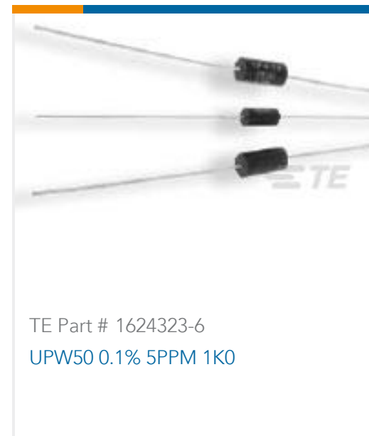
TE Part # 1624323-6 UPW50 0.1% 5PPM 1K0