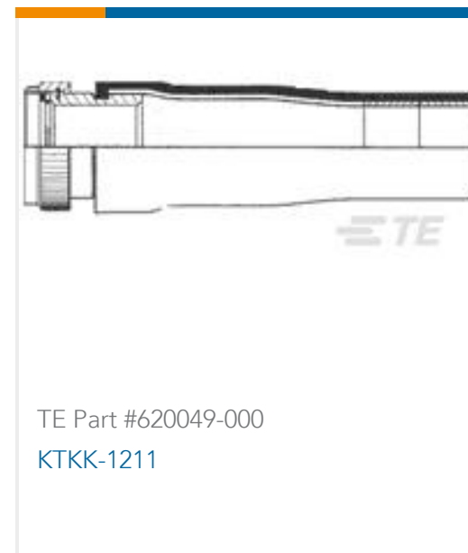
TE Part #620049-000 KTKK-1211