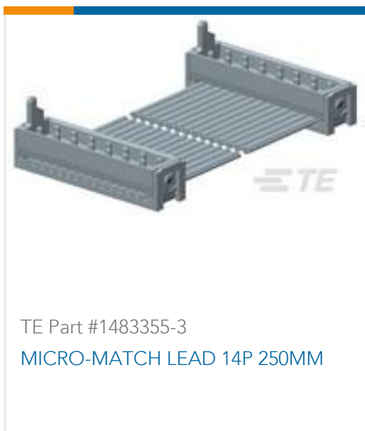
TE Part #1483355-3 MICRO-MATCH LEAD 14P 250MM