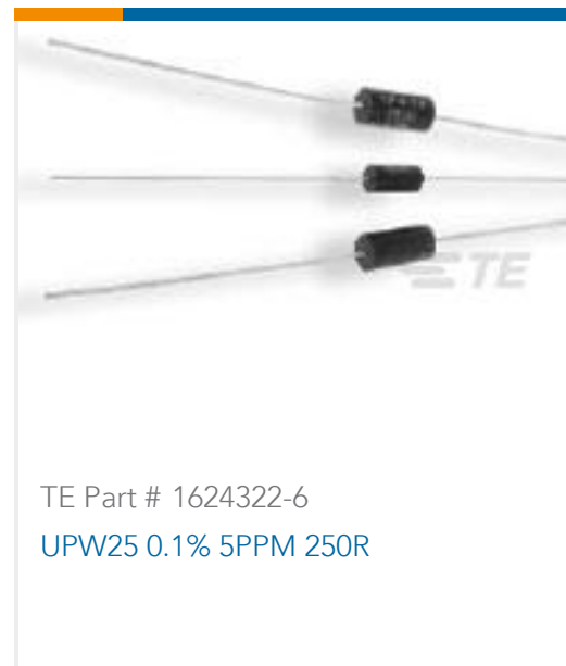
TE Part # 1624322-6 UPW25 0.1% 5PPM 250R