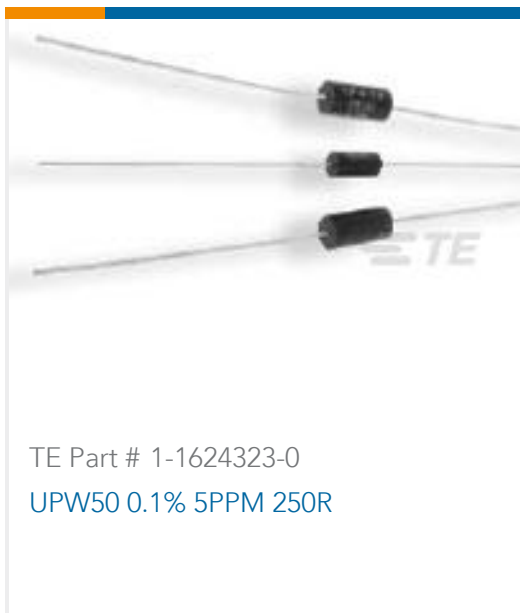
TE Part # 1-1624323-0 UPW50 0.1% 5PPM 250R