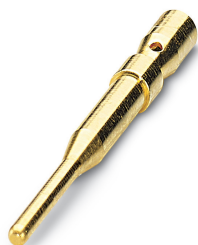
Crimp contact, turned, contact diameter: 1 mm, crimp range: 0.5 mm 2 ... 1 mm 2

Please be informed that the data shown in this PDF Document is generated from our Online Catalog. Please find the complete data in the user's documentation. Our General Terms of Use for Downloads are valid ( http://phoenixcontact.com/download )