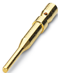
Crimp contact, turned, contact diameter: 1 mm, crimp range: 0.14 mm 2 ... 0.56 mm 2

Please be informed that the data shown in this PDF Document is generated from our Online Catalog. Please find the complete data in the user's documentation. Our General Terms of Use for Downloads are valid ( http://phoenixcontact.com/download )