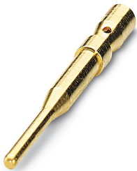
Crimp contact, turned, contact diameter: 1 mm, crimp range: 0.08 mm 2 ... 0.22 mm 2

Please be informed that the data shown in this PDF Document is generated from our Online Catalog. Please find the complete data in the user's documentation. Our General Terms of Use for Downloads are valid ( http://phoenixcontact.com/download )