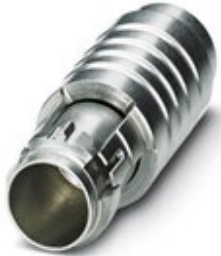
Unlocking tool for contact carriers for snapping in the M23 signal device connectors

Please be informed that the data shown in this PDF Document is generated from our Online Catalog. Please find the complete data in the user's documentation. Our General Terms of Use for Downloads are valid ( http://phoenixcontact.com/download )