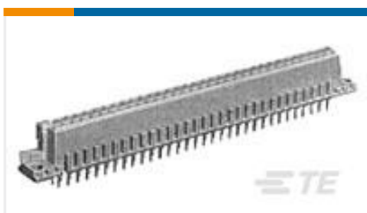
TE Part #5536460-5 ASSY,RECEPT,EURO,TYPE B,LEAD-F