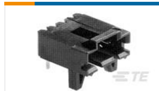
TE Part #5-103904-3 4 MTE HDR SRRA LATCH W/HLDWN