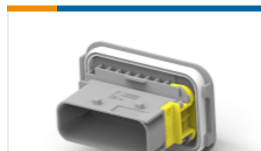
TE Part #2-1564536-1 4POS,TAB5.8X0.8,TABHSG,ASSY, COD. B