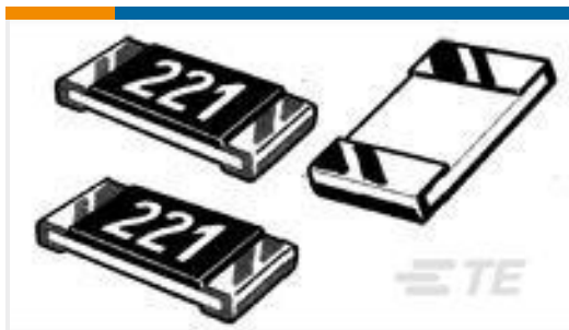
TE Part #8-2176070-8 3521 43K 1% 2W