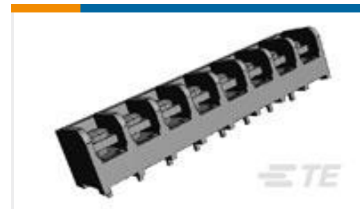
TE Part #1-1437653-3 6PCV-08-006=6PCV ASSEMBLY