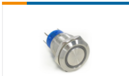
TE Part #2-2213767-5 AV19 SPL 5A MOVE RING LED RED 12V