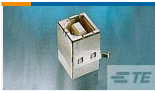
TE Part #292317-4 STD USB TYPE B, R/A, T/H