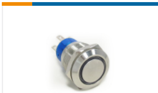
TE Part #2213763-3 AV19 SPL 5A NO LED