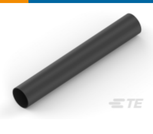
TE Part #NB19162001 RNF-100-1/8-BK-STK