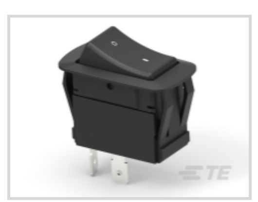
Relays, Contactors & Switches > Switches > Rocker Switches