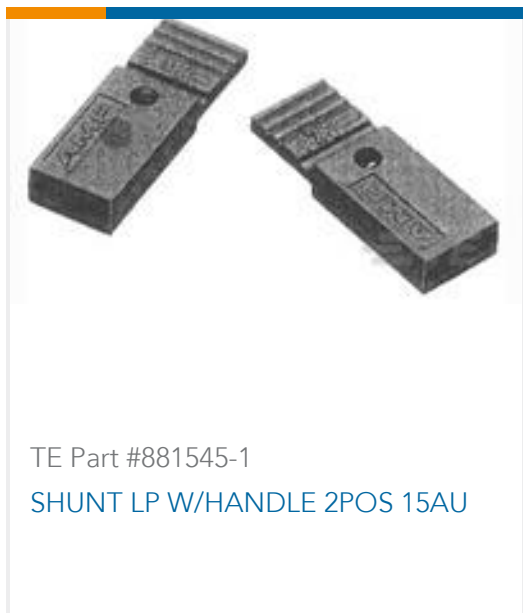
TE Part #881545-1 SHUNT LP W/HANDLE 2POS 15AU