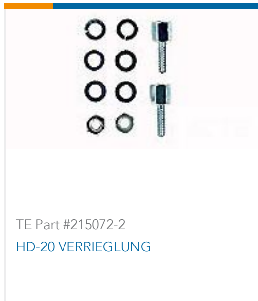
TE Part #215072-2 HD-20 VERRIEGLUNG