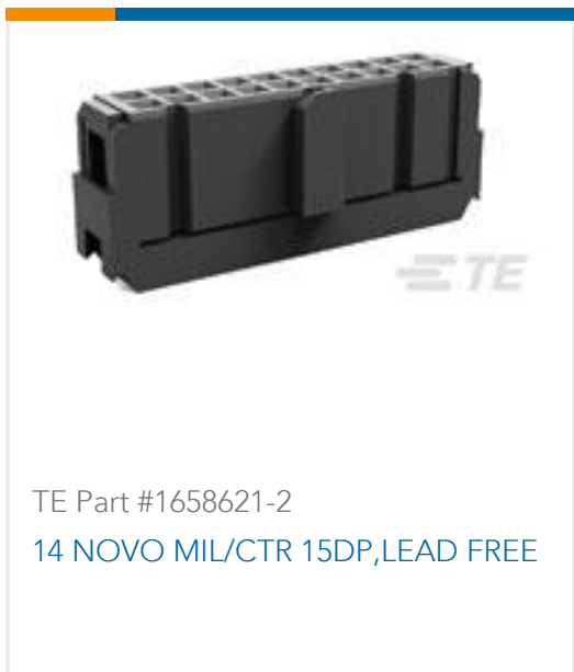
TE Part #1658621-2 14 NOVO MIL/CTR 15DP, LEAD FREE