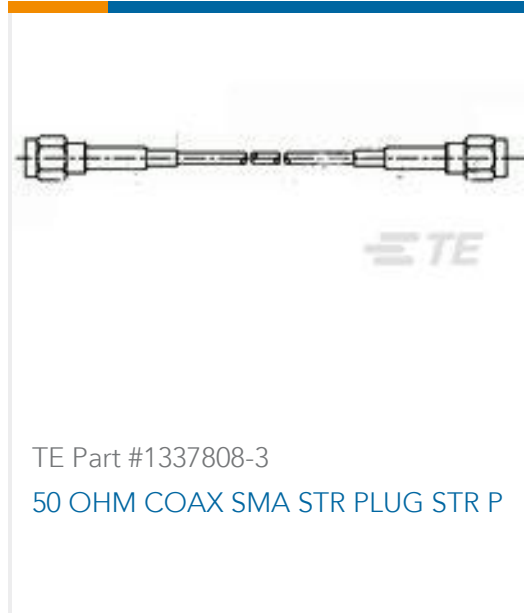
TE Part #1337808-3 50 OHM COAX SMA STR PLUG STR P