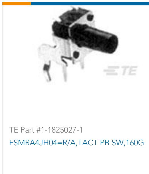
TE Part #1-1825027-1 FSMRA4JH04=R/A, TACT PB SW, 160G