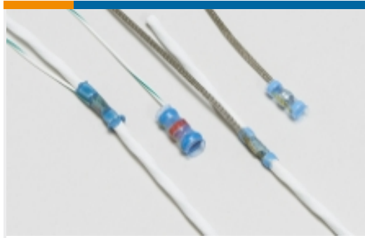
SolderSleeve Shield Terminators(25)