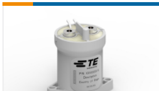
TE Part #2203194-1 EVC135, RELAY, SPST NO