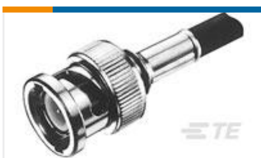
TE Part #2-331350-9 BNC PLUG