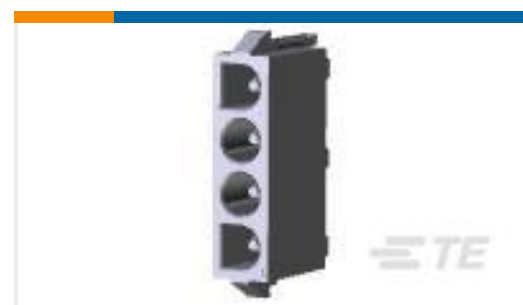
TE Part #641968-3 04P UMNL PIN HDR ASSY POL 94VO