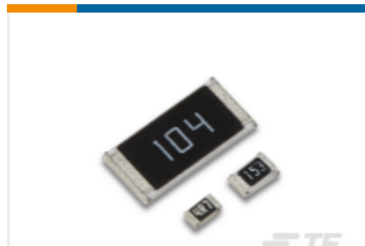
TE Part #4-2176341-6 CRGCO 0805 56K 1%