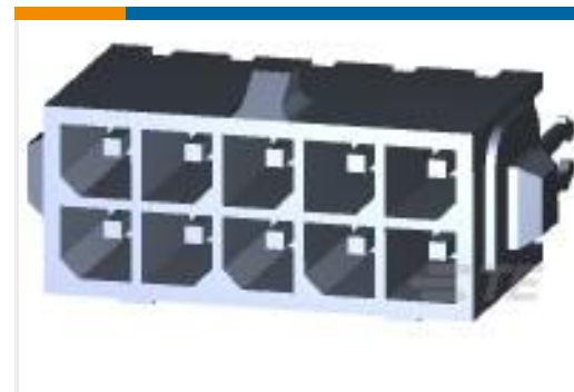
TE Part #4-794682-0 10P MICRO MNL ASSY,VRT,THRU,LF