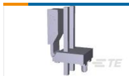
TE Part #3-644615-2 02P MTA156 POL HDR ASSY LF