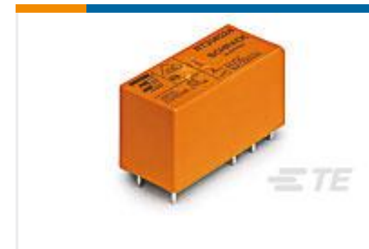
TE Part #7-1415014-1 RT31LA24