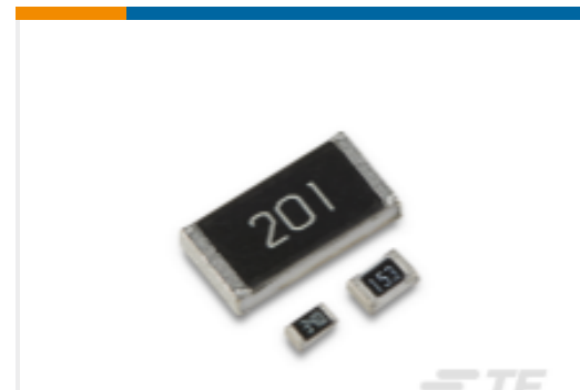
TE Part #5-2176331-4 CRGP 2512 270K 1%