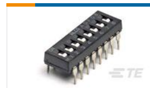
TE Part #2-1825059-3 ADF05ST04=DIP SWT,FLUSH,SMT-GW