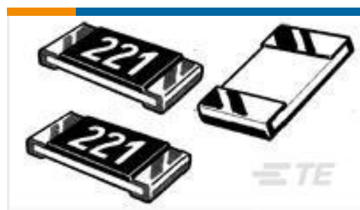
TE Part #9-2176070-2 3521 62K 1% 2W