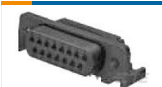
TE Part #5745397-2 HD-20 RCPT 25P RA 318 FFSCRLK