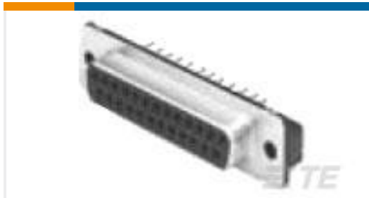
TE Part #1-5747299-4 15 RCPT SP/FMS SCRLK