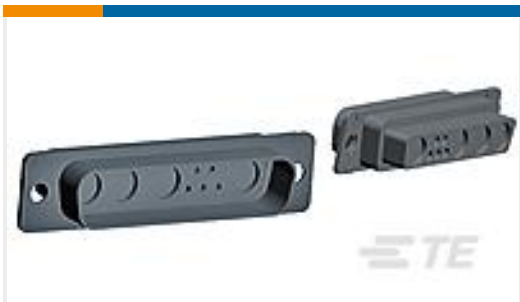
TE Part #212498-1 PLUG ASSY,9C4,AMPLIMITE