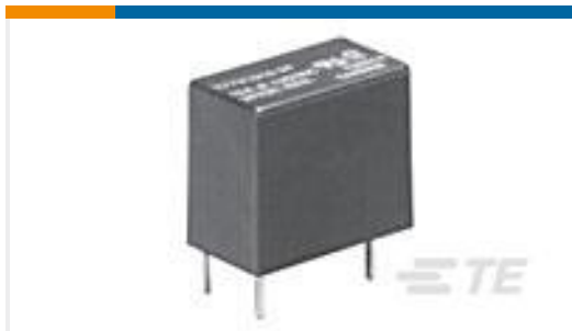
TE Part #2-1393194-6 T77V1D3-12