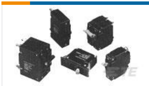
TE Part #7-1393254-7 W92-X112-30=M6/M7/M9/W6/W7