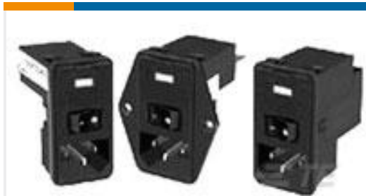
TE Part #6-6609107-4 PS0S0SS3B=C1123