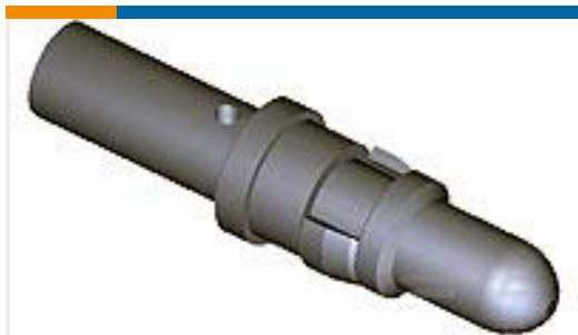
TE Part #212007-1 CONTACT PIN ASSY, SZ 8