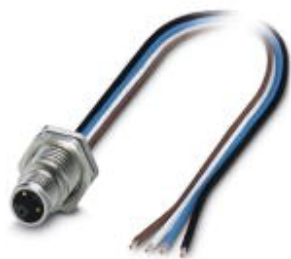
Flush-type connector, Power, 4-position, Plug, M12, L - Power, Rear mounting, M16 x 1.5, Individual wires, cable length: 0.2 m

Please be informed that the data shown in this PDF Document is generated from our Online Catalog. Please find the complete data in the user's documentation. Our General Terms of Use for Downloads are valid ( http://phoenixcontact.com/download )