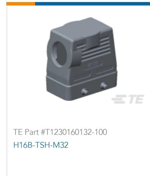
TE Part #T1230160132-100 H16B-TSH-M32