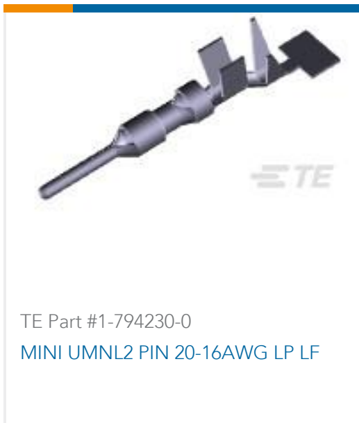
TE Part #1-794230-0 MINI UMNL2 PIN 20-16AWG LP LF