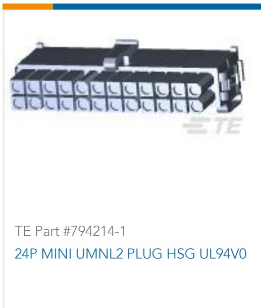
TE Part #794214-1 24P MINI UMNL2 PLUG HSG UL94V0