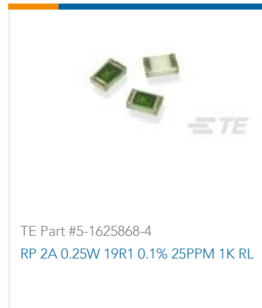
TE Part #5-1625868-4 RP 2A 0.25W 19R1 0.1% 25PPM 1K RL