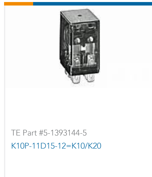
TE Part #5-1393144-5 K10P-11D15-12=K10/K20