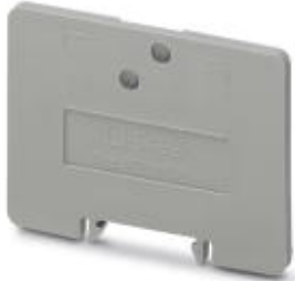
Partition plate, Length: 42.5 mm, Width: 2.5 mm, Height: 30.5 mm, Color: gray

Please be informed that the data shown in this PDF Document is generated from our Online Catalog. Please find the complete data in the user's documentation. Our General Terms of Use for Downloads are valid ( http://phoenixcontact.com/download )