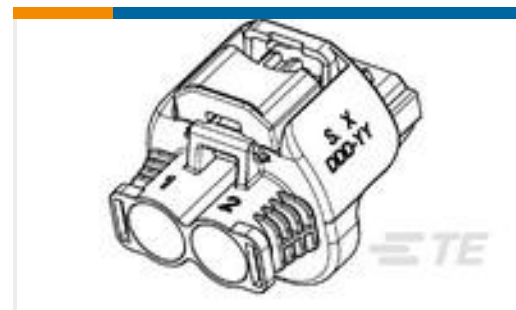
TE Part #1544978-1 RECEPT HSG ASSY, 8MM NG1+, 2W, SEALED