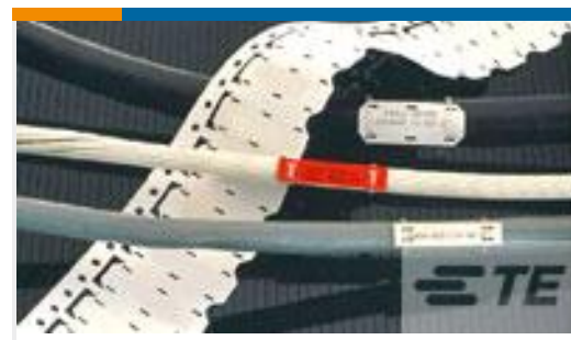
TE Part #0479490001 HTCM-SCE-1/2-4H-9