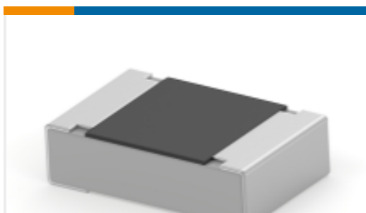
TE Part #3-2176342-7 CRGCO 0805 1M0 5%