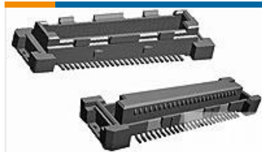
TE Part #1-5353190-0 .6FHR04H,140,S,GIG,08/Sn,TR,NSYes