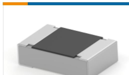
TE Part #3-2176342-0 CRGCO 0805 68K 5%