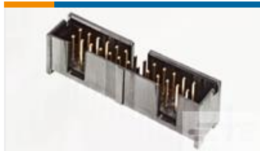
TE Part #5103308-6 A/L LOW PRO HDR 26P VERT BLACK