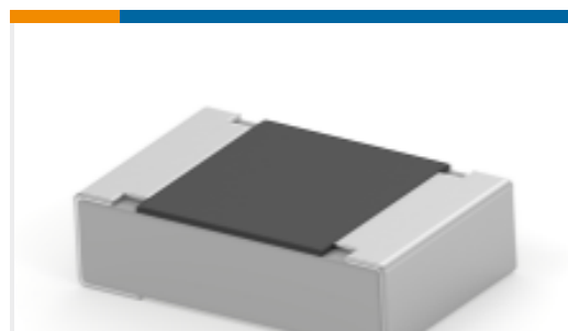
TE Part #1-2176342-8 CRGCO 0805 680R 5%