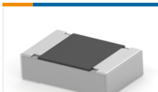
TE Part #3-2176342-5 CRGCO 0805 470K 5%