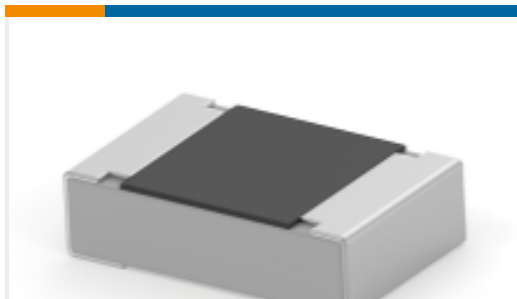
TE Part #2-2176342-4 CRGCO 0805 6K8 5%