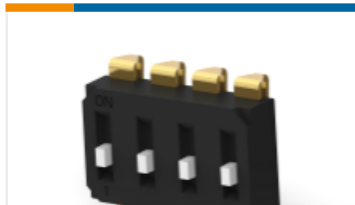
TE Part #1-2319847-4 END STACK DIP 4P J RAISED TUBE