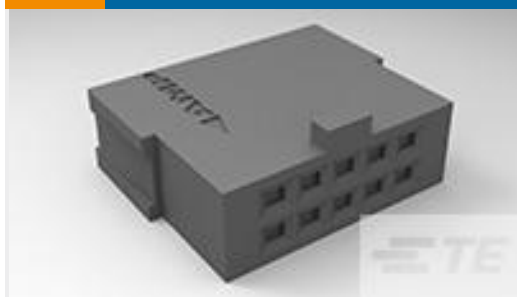
TE Part # 487223-9 034 HOUSING FFC RCPT 100CL DR