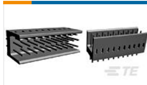
TE Part #1-826469-2 2X12P MOD II SHROUDED HEADER, ST