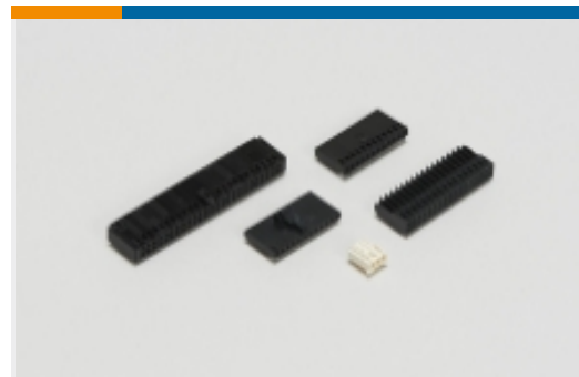
Wire-to-Board Connector Assemblies & Housings(5)