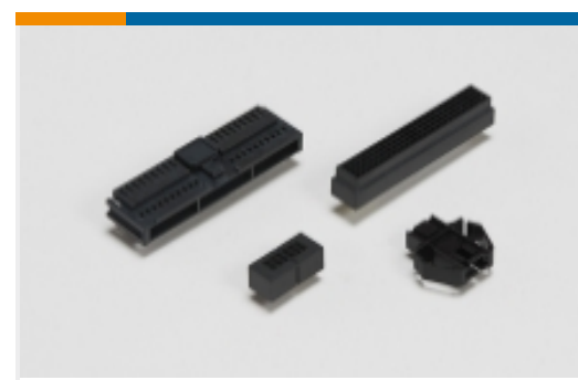
PCB Connector Shrouds(1)