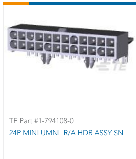
TE Part #1-794108-0 24P MINI UMNL R/A HDR ASSY SN