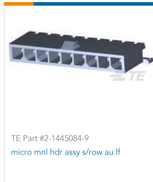
TE Part #2-1445084-9 micro mnl hdr assy s/row au lf