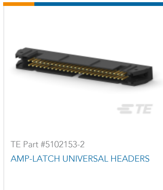
TE Part #5102153-2 AMP-LATCH UNIVERSAL HEADERS