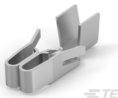
TE Part #2-880492-2 FUSE CONTACT - BUS