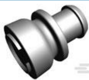
TE Part # 828922-1 2,5MM CAVITY PLUG FOR 5,4MM DI