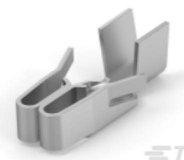
TE Part #4-880492-2 FUSE CONTACT - BUS