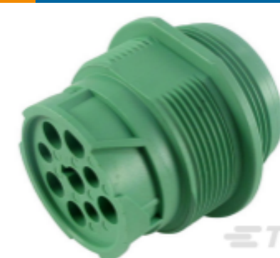
TE Part #HD10-9-1939PE-BP03 RECP ASM