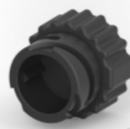
TE Part # 185636-1 PROTECT CAP 2.5MM PLUG