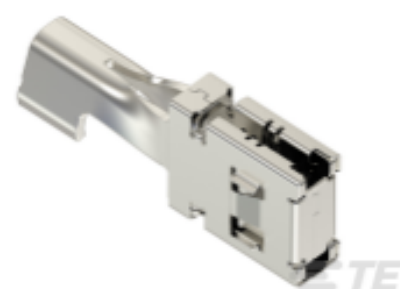
TE Part #1-2840573-1 PCON12,TERMINAL,FAM SLD/UNSLD