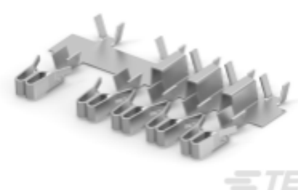
TE Part #4-880490-2 FUSE CONTACT - BUS