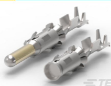
TE Part # CAT-R7602-T273 ROUND CONNECTOR SYSTEM, PIN AND SOCKET