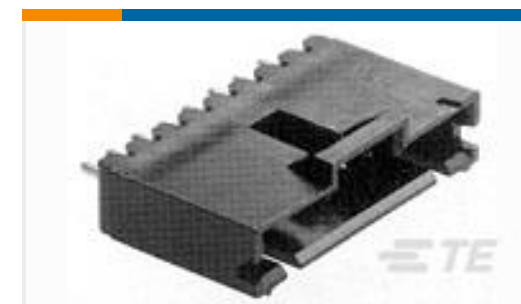
TE Part #5-104362-1 02 MTE HDR SRST LATCH W/HLDWN