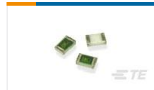
TE Part #4-2176089-6 RP 1J 0.166W 33K2 0.1% 25PPM 1K RL