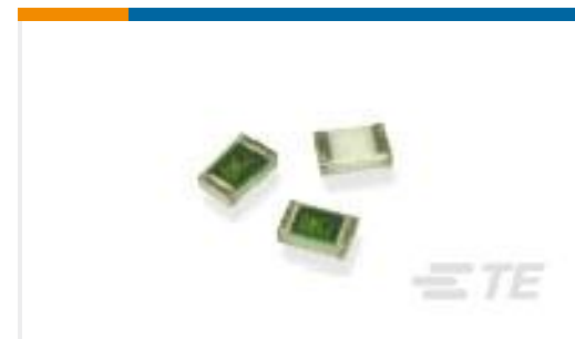
TE Part #1676307-2 RN 0805 33K2 0.1% 10PPM 1KRL