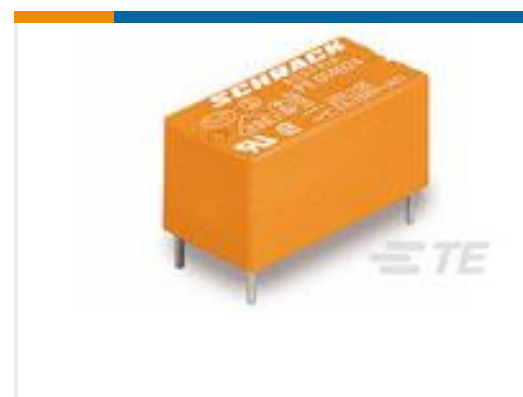
TE Part #1-1393219-0 PE014024