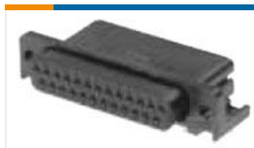
TE Part #5747461-3 HD-20 RCPT 25P RA 590 THD INS