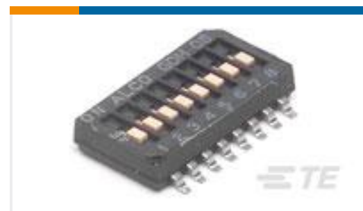
TE Part #1-1571983-1 GDH08STR04=DIP SWITCH