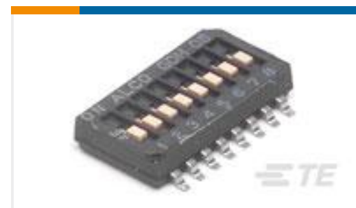
TE Part #1571983-3 GDH02STR04=DIP SWITCH