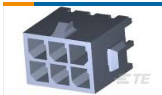
TE Part #3-794630-6 06P MICRO MNL ASSY VRT HDR LF