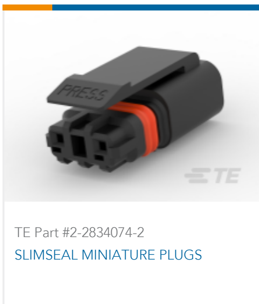
TE Part #2-2834074-2 SLIMSEAL MINIATURE PLUGS