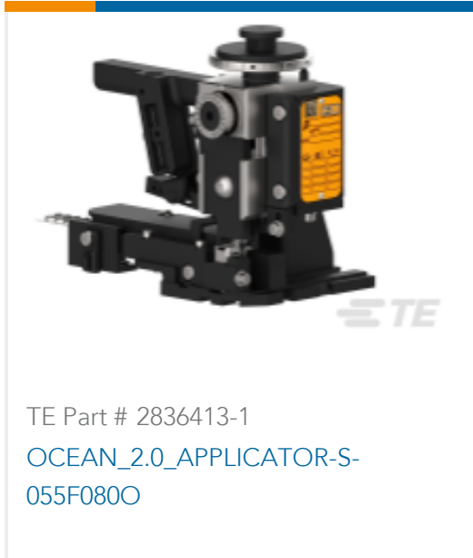
TE Part # 2836413-1 OCEAN_2.0_APPLICATOR-S- 055F0800