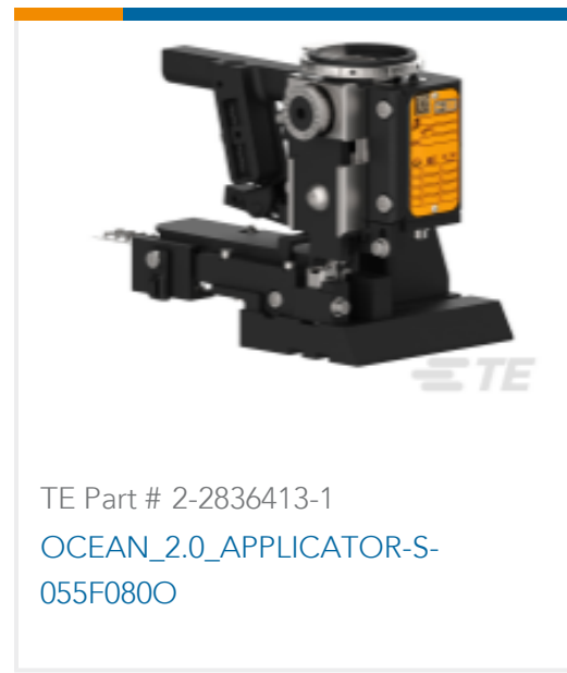
TE Part # 2-2836413-1 OCEAN_2.0_APPLICATOR-S- 055F0800