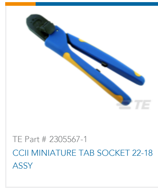
TE Part # 2305567-1 CCII MINIATURE TAB SOCKET 22-18 ASSY