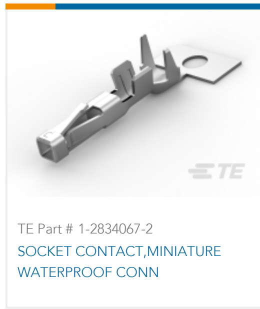
TE Part # 1-2834067-2 SOCKET CONTACT,MINIATURE WATERPROOF CONN