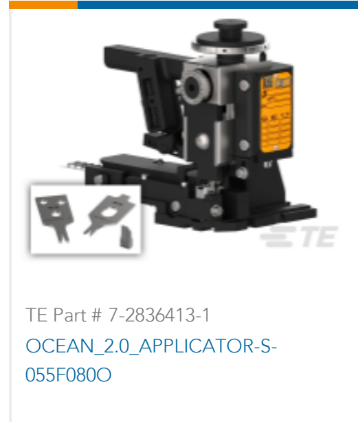
TE Part # 7-2836413-1 OCEAN_2.0_APPLICATOR-S- 055F0800