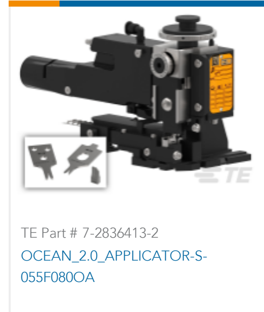
TE Part # 7-2836413-2 OCEAN_2.0_APPLICATOR-S- 055F0800A