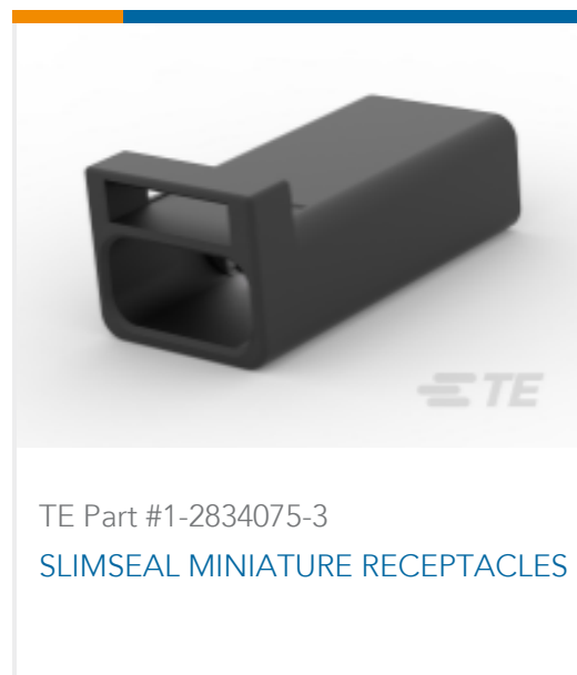
TE Part #1-2834075-3 SLIMSEAL MINIATURE RECEPTACLES