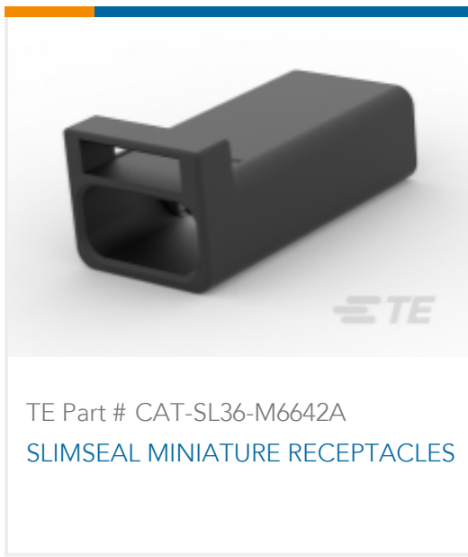
TE Part # CAT-SL36-M6642A SLIMSEAL MINIATURE RECEPTACLES