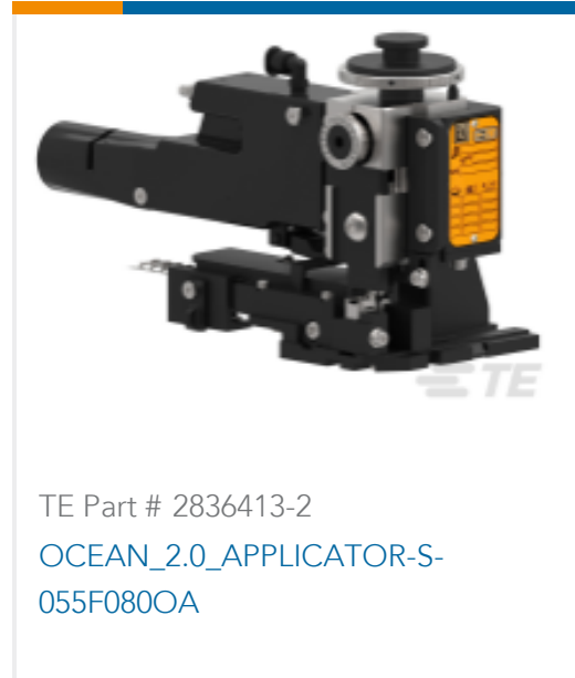
TE Part # 2836413-2 OCEAN_2.0_APPLICATOR-S- 055F0800A