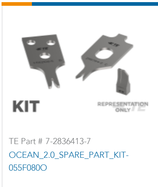
TE Part # 7-2836413-7 OCEAN_2.0_SPARE_PART_KIT- 055F0800