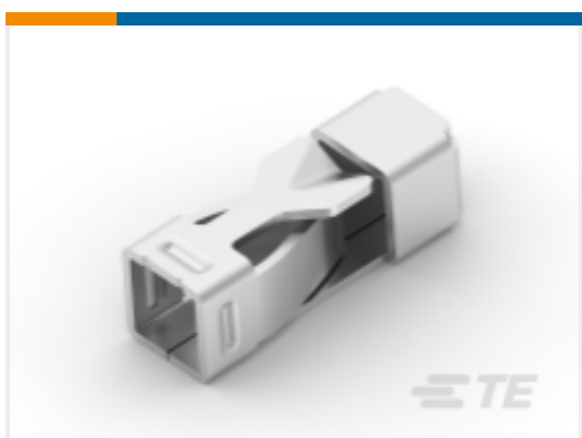
TE Part # 2834167-3 RELEASABLE SLIM CONTACT