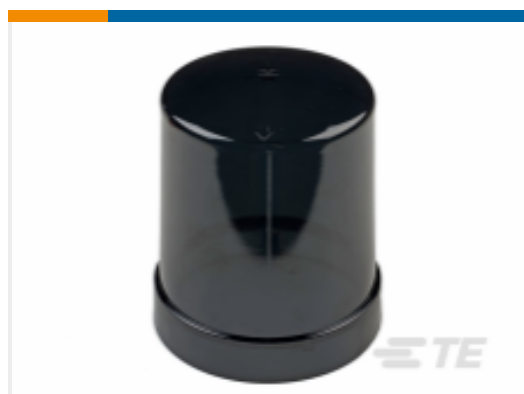
TE Part #1-2306128-1 PHOTO CONTROL COVER