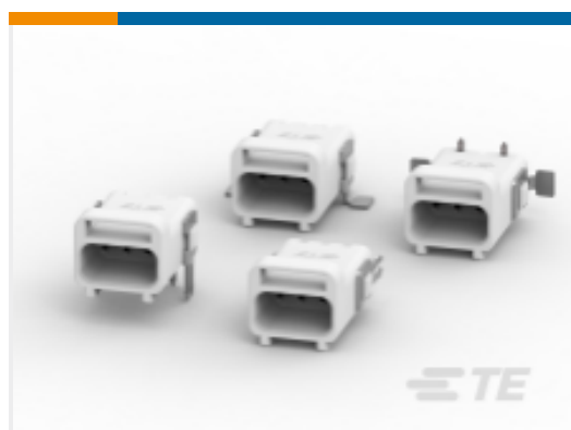
TE Part # CAT-SL36-M6642B SLIMSEAL MINIATURE HEADERS