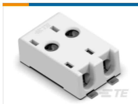
TE Part # 2834385-2 RELEASE POKE-IN CONNECTOR_2P_NATURAL