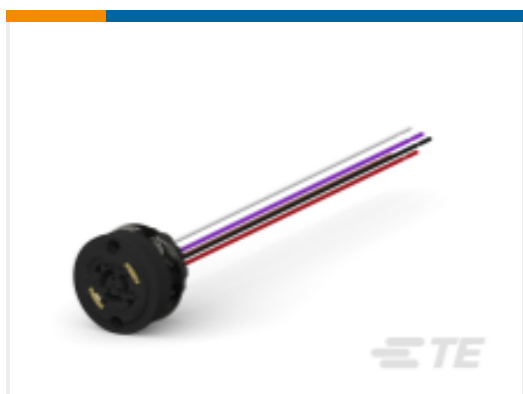
TE Part #2-2332966-1 RECEPTACLE, TOOL-LESS ROTATABLE DIMMING