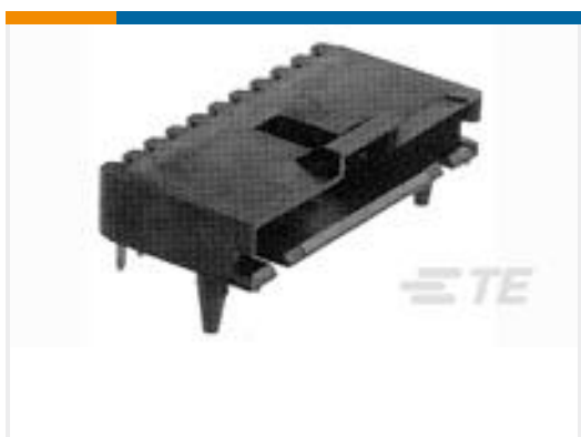
TE Part #5-104361-2 03 MTE HDR SRRA LATCH W/HLDWN