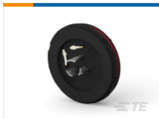
TE Part #1-2213871-1 LIGHT CONTROLLER BASE ASSY, 76MM DIA,5POS