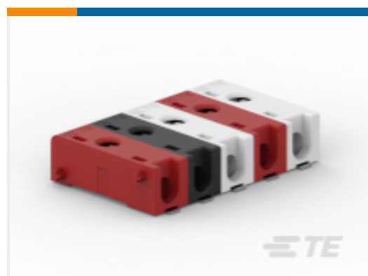
TE Part # CAT-B8519-P7565 BUCHANAN WIREMATE POKE-IN