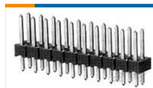
TE Part #826942-4 4P MOD2 STIFT LEI