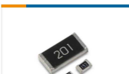
TE Part #2-2176326-7 CRGP 0603 1K5 1%