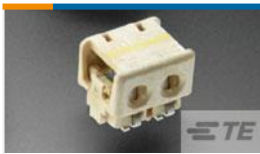
TE Part # 1-2106003-4 Connector, SMT-IDC, 4 POS, 20 AWG