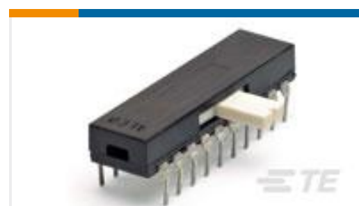
TE Part #3-1825010-7 ASE6204=6PDT AUTOSLIDE