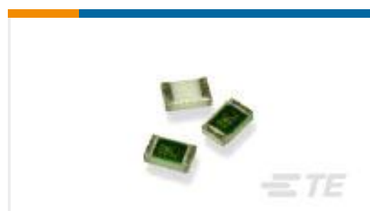
TE Part #5-1676481-7 CPF 0603 1K3 0.1% 25PPM 1K RL