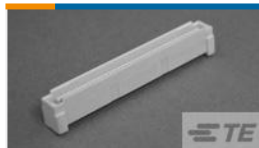
TE Part #3-5177986-2 0.8FH,P08H.5,060,08/Sn,TR,SC