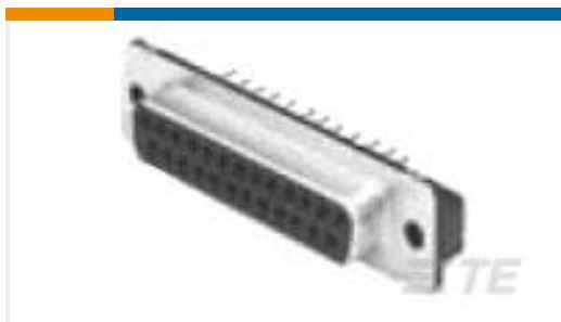
TE Part #3-338314-2 15POS.HD20 REC.ASSY