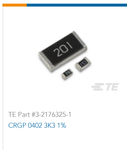
TE Part #3-2176325-1 CRGP 0402 3K3 1%