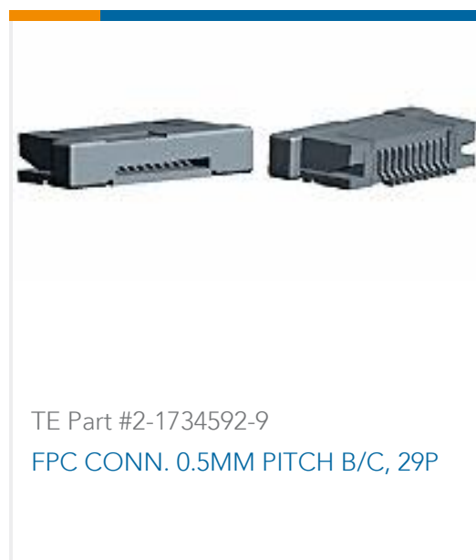
TE Part #2-1734592-9 FPC CONN. 0.5MM PITCH B/C, 29P