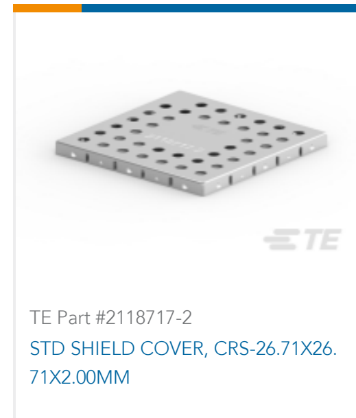
TE Part #2118717-2 STD SHIELD COVER, CRS-26.71X26.71X2.00MM