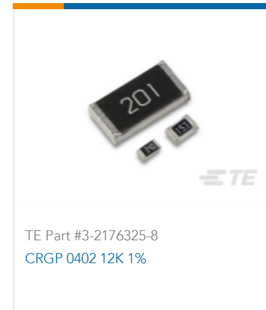
TE Part #3-2176325-8 CRGP 0402 12K 1%