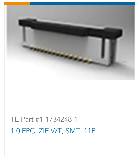
TE Part #1-1734248-1 1.0 FPC, ZIF V/T, SMT, 11P