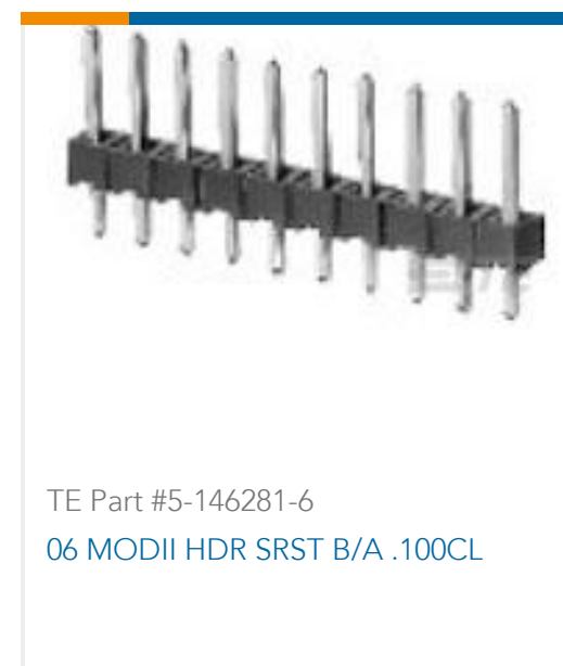
TE Part #5-146281-6 06 MODII HDR SRST B/A .100CL