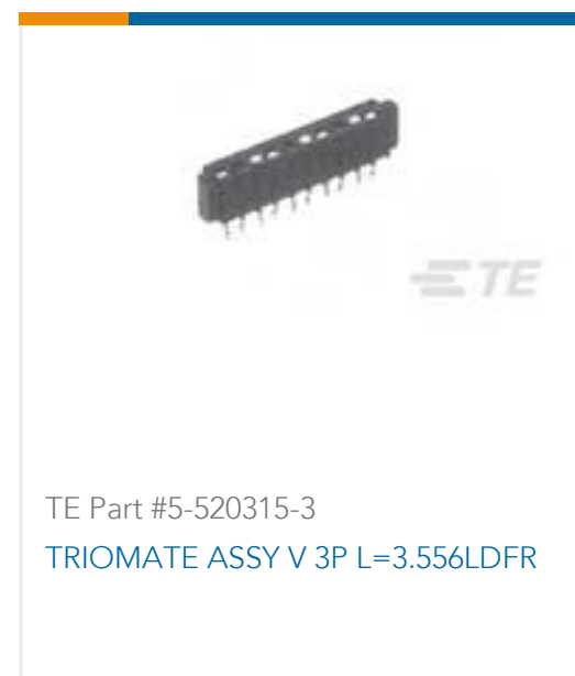
TE Part #5-520315-3 TRIOMATE ASSY V 3P L=3.556LDFR