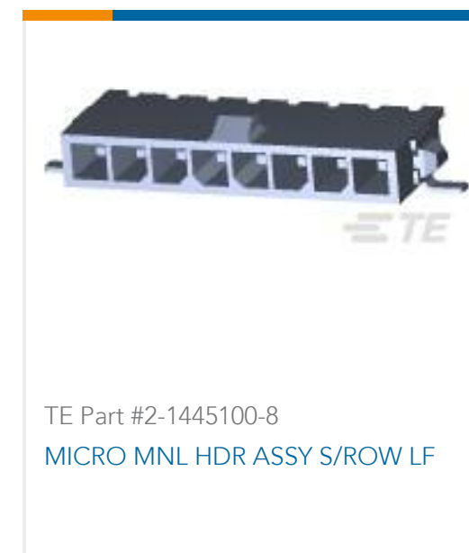
TE Part #2-1445100-8 MICRO MNL HDR ASSY S/ROW LF