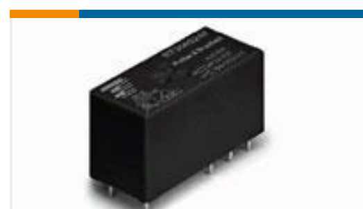
TE Part #3-1393237-1 RTE24012F