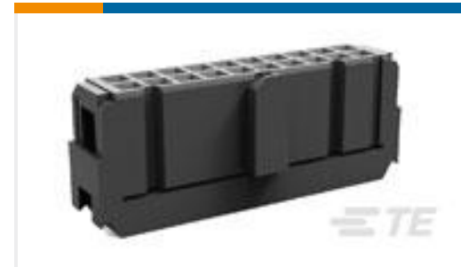
TE Part #1658621-3 16 NOVO MIL/CTR 15DP, LEAD FREE