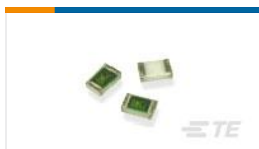
TE Part #1676209-2 RN 0805 17K8 0.1% 10PPM 1KRL