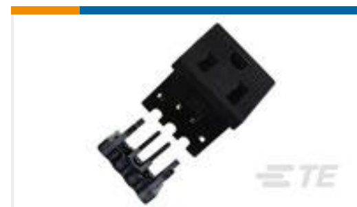
TE Part #208979-2 CONV OUTLET ASSY (BLACK)