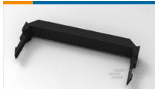
TE Part #499252-8 016 STRAIN RELIEF A-L RCPT