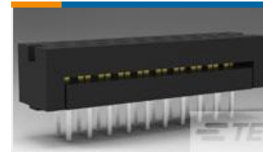
TE Part #2-746610-1 010 DIP PLUG 100CL TIN