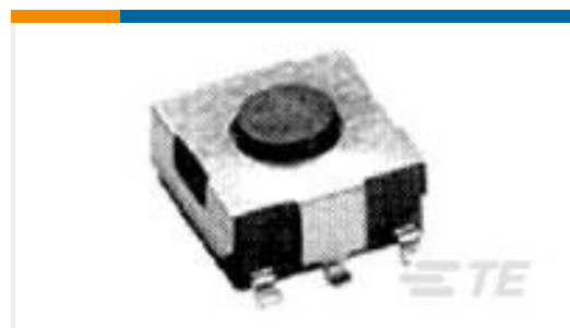
TE Part #1-1437565-9 FSM1LPTR=NEW P/N