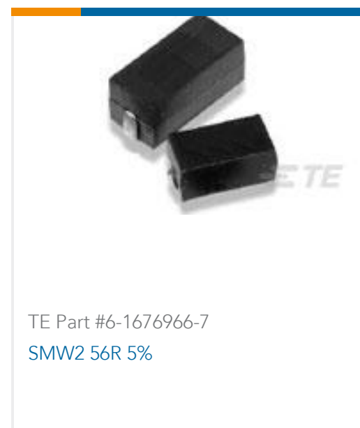
TE Part #6-1676966-7 SMW2 56R 5%