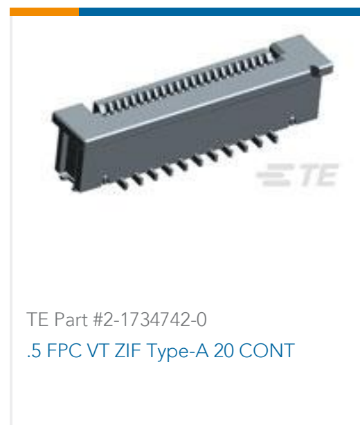
TE Part #2-1734742-0 .5 FPC VT ZIF Type-A 20 CONT