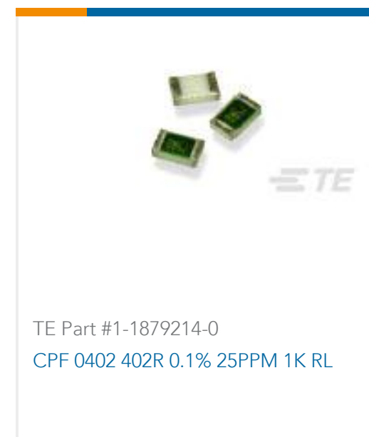
TE Part #1-1879214-0 CPF 0402 402R 0.1% 25PPM 1K RL