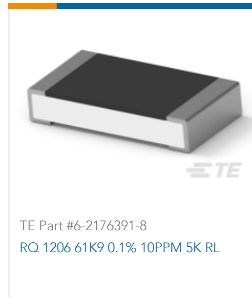
TE Part #6-2176391-8 RQ 1206 61K9 0.1% 10PPM 5K RL