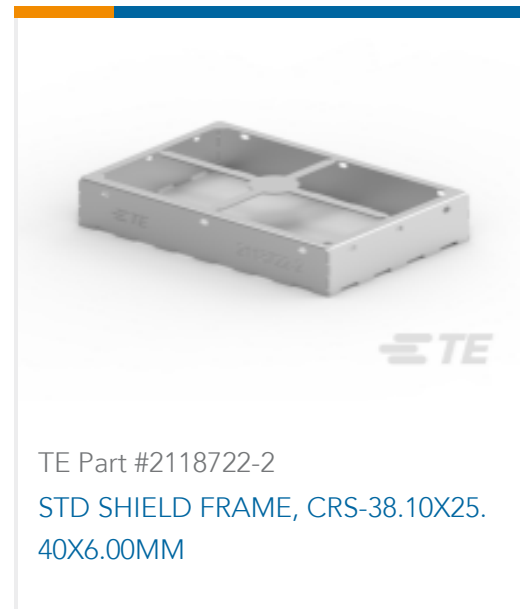
TE Part #2118722-2 STD SHIELD FRAME, CRS-38.10X25. 40X6.00MM