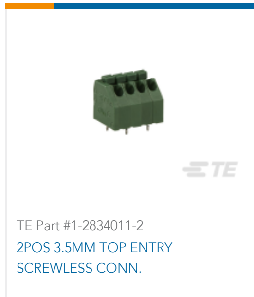
TE Part #1-2834011-2 2POS 3.5MM TOP ENTRY SCREWLESS CONN.