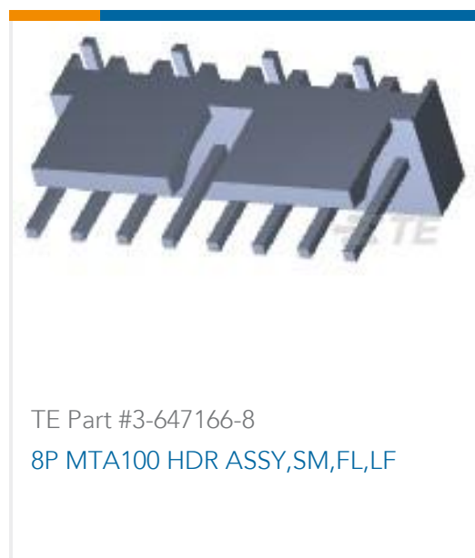
TE Part #3-647166-8 8P MTA100 HDR ASSY, SM, FL, LF