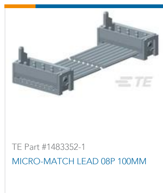
TE Part #1483352-1 MICRO-MATCH LEAD 08P 100MM