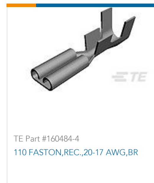
TE Part #160484-4 110 FASTON,REC.,20-17 AWG,BR