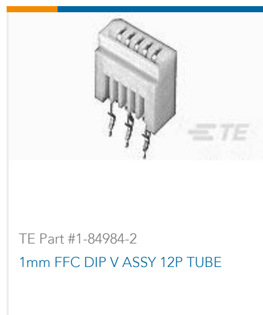
TE Part #1-84984-2 1mm FFC DIP V ASSY 12P TUBE