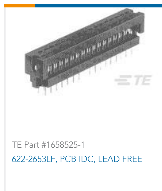
TE Part #1658525-1 622-2653LF, PCB IDC, LEAD FREE