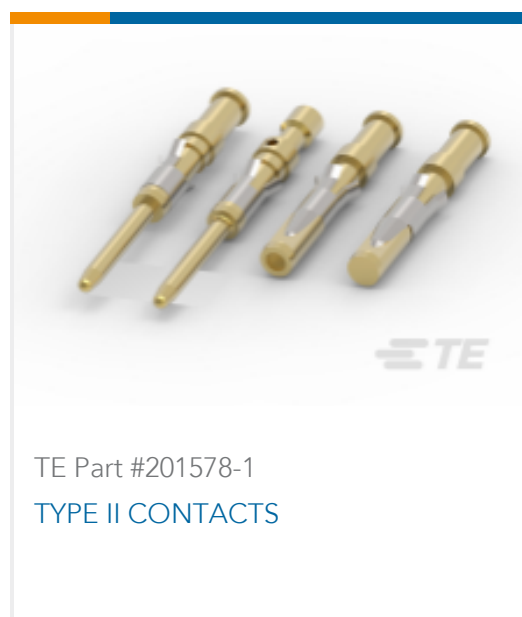
TE Part #201578-1 TYPE II CONTACTS