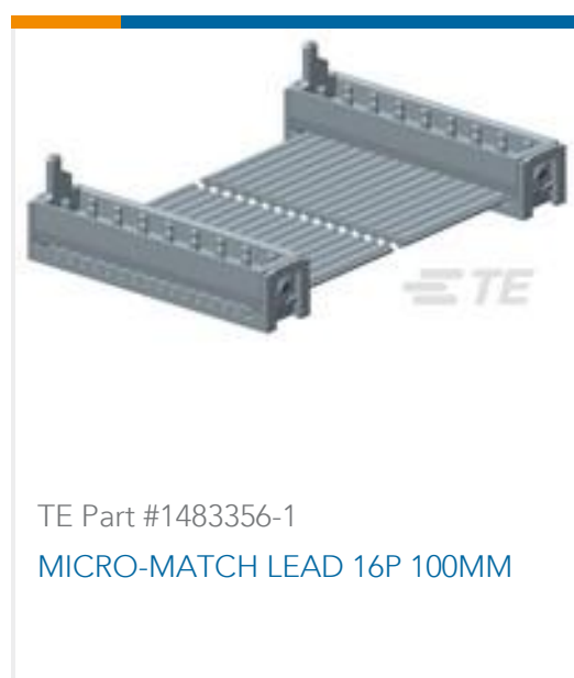
TE Part #1483356-1 MICRO-MATCH LEAD 16P 100MM