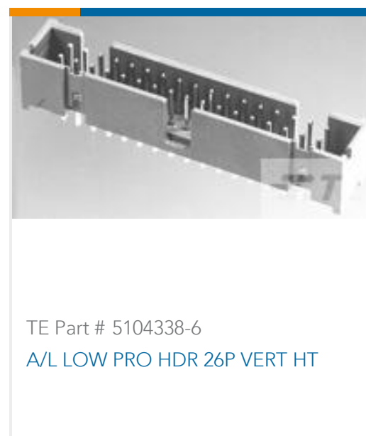
TE Part # 5104338-6 A/L LOW PRO HDR 26P VERT HT