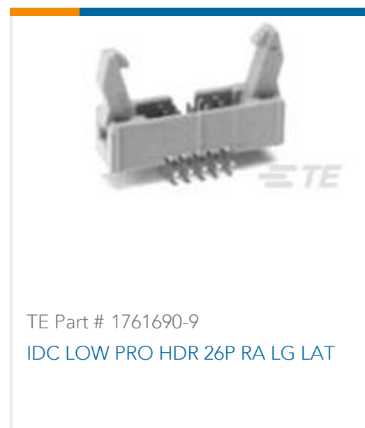
TE Part # 1761690-9 IDC LOW PRO HDR 26P RA LG LAT