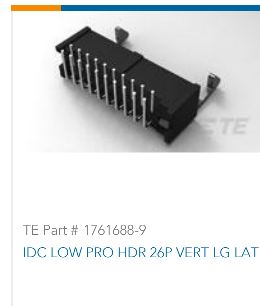
TE Part # 1761688-9 IDC LOW PRO HDR 26P VERT LG LAT