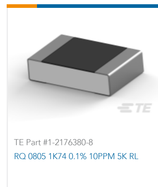
TE Part #1-2176380-8 RQ 0805 1K74 0.1% 10PPM 5K RL