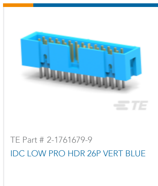
TE Part # 2-1761679-9 IDC LOW PRO HDR 26P VERT BLUE