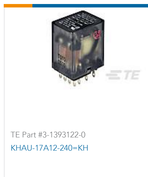
TE Part #3-1393122-0 KHAU-17A12-240=KH