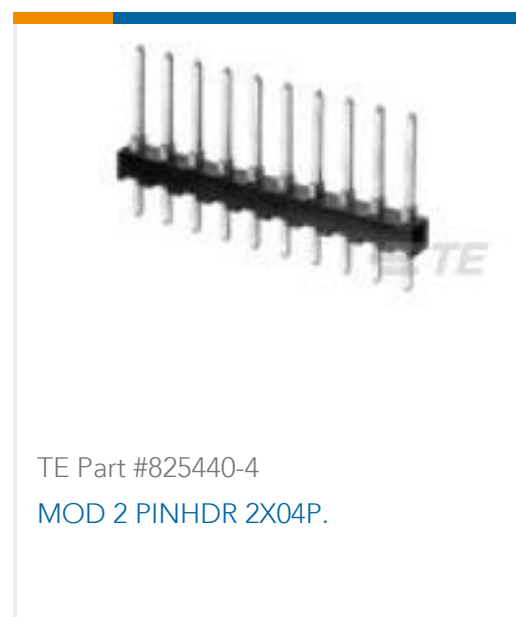
TE Part #825440-4 MOD 2 PINHDR 2X04P