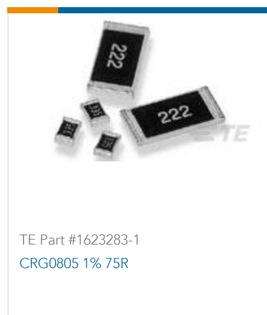
TE Part #1623283-1 CRG0805 1% 75R