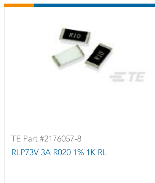
TE Part #2176057-8 RLP73V 3A R020 1% 1K RL