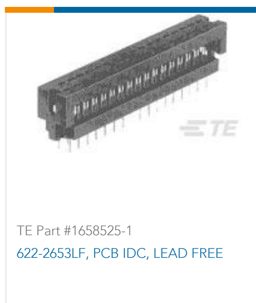
TE Part #1658525-1 622-2653LF, PCB IDC, LEAD FREE