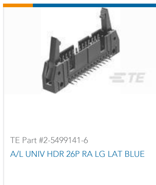
TE Part #2-5499141-6 A/L UNIV HDR 26P RA LG LAT BLUE