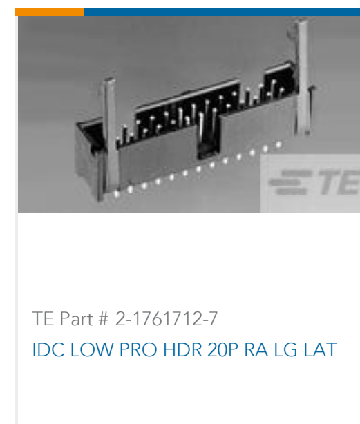
TE Part # 2-1761712-7 IDC LOW PRO HDR 20P RA LG LAT