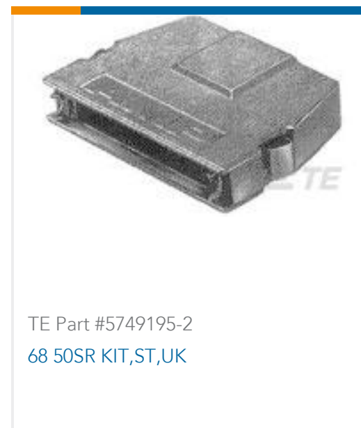
TE Part #5749195-2 68 50SR KIT,ST,UK