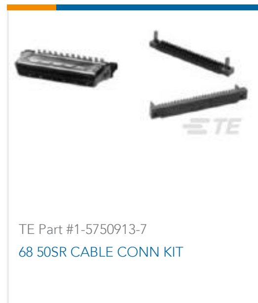
TE Part #1-5750913-7 68 50SR CABLE CONN KIT