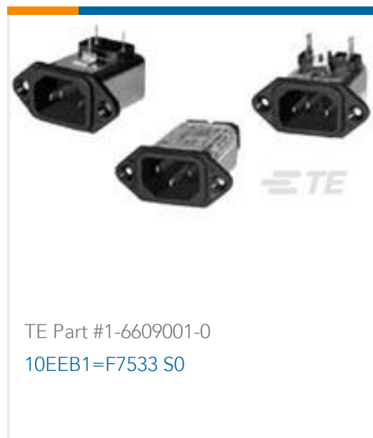
TE Part #1-6609001-0 10EEB1=F7533 S0