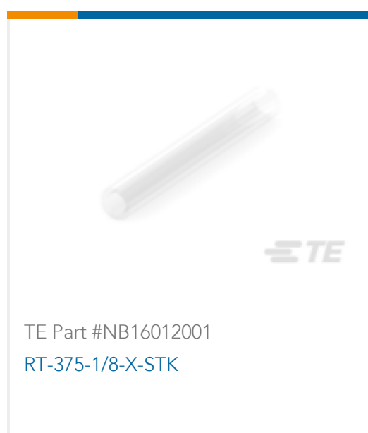
TE Part #NB16012001 RT-375-1/8-X-STK