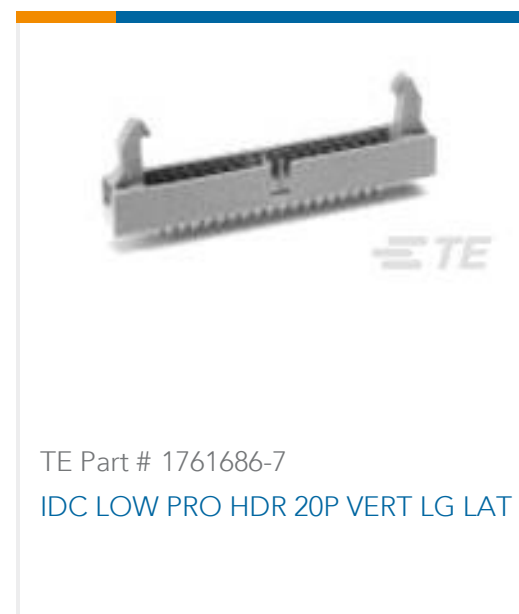
TE Part # 1761686-7 IDC LOW PRO HDR 20P VERT LG LAT