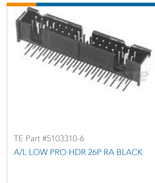
TE Part #5103310-6 A/L LOW PRO HDR 26P RA BLACK