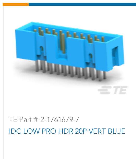
TE Part # 2-1761679-7 IDC LOW PRO HDR 20P VERT BLUE