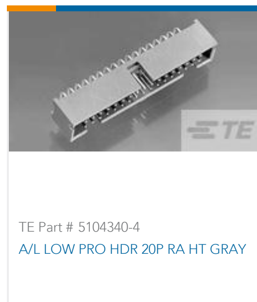
TE Part # 5104340-4 A/L LOW PRO HDR 20P RA HT GRAY