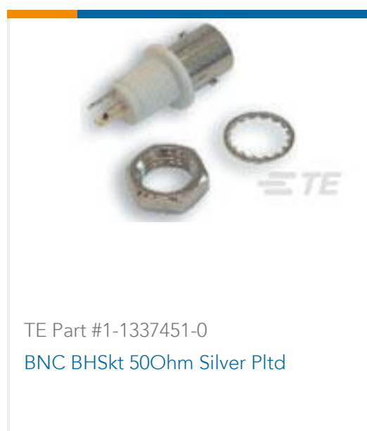
TE Part #1-1337451-0 BNC BHSkt 50Ohm Silver Pltd