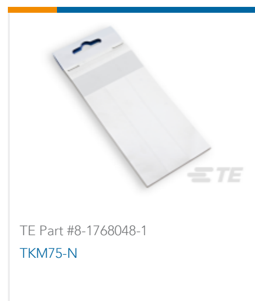
TE Part #8-1768048-1 TKM75-N