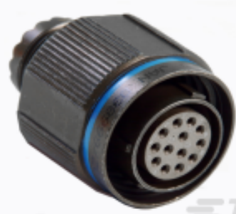
TE Part # YDTS26F11-35SNV001 PLUG ASSY