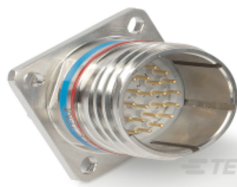
TE Part # YDTS20F09-35SNV001 RECP ASSY