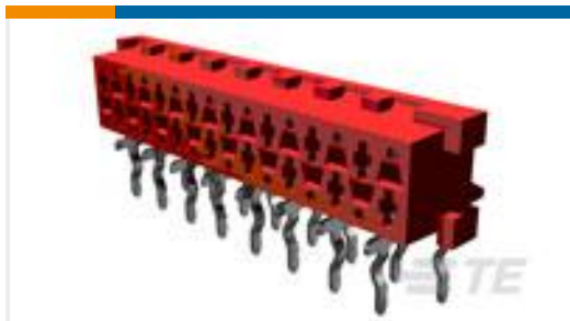
TE Part #215460-4 MICRO-MATCH FEM.SE