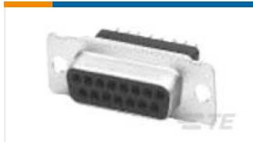
TE Part #5745191-1 50 RCPT SP/MS STD