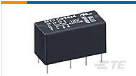
TE Part #3-1462000-1 C93416=MT Relay 200 mW 5 V