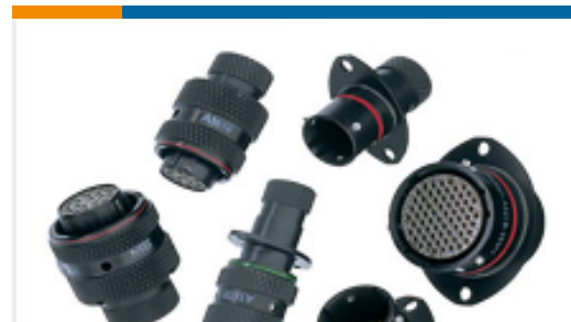
TE Part #AS214-35PN-CLNUT RECEPT.BOX