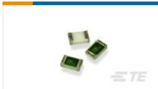
TE Part #5-1614881-9 CPF 0603 100R 0.1% 25PPM 5K RL