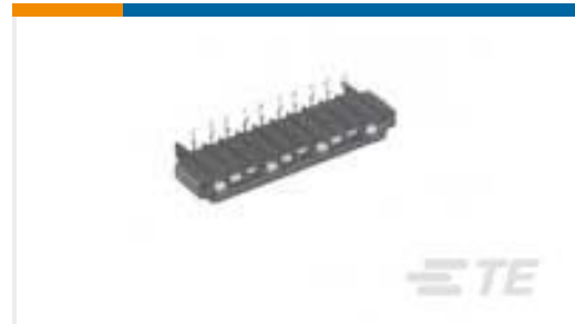
TE Part #5-520314-7 TRIOMATE ASSY H 7P L=2.54 LDFR