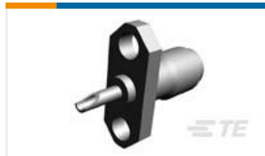
TE Part #1045581-1 1052 1300 00