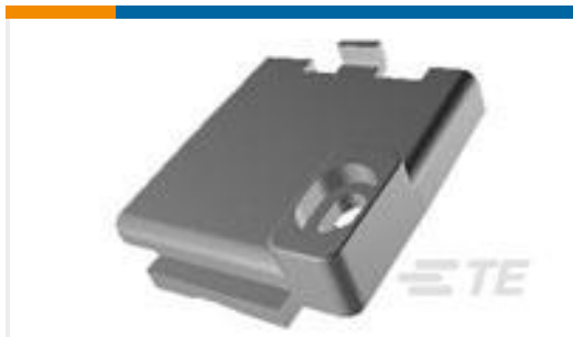
TE Part #641776-1 04P UMNL STR/REL