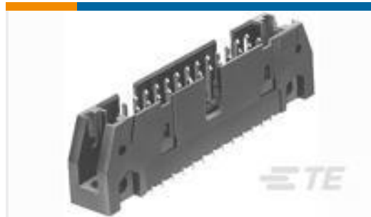
TE Part #102154-1 010 UNIV HDR SP 4S 30DP STD