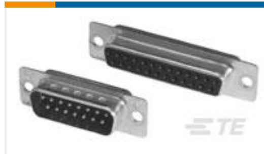
TE Part #5-747905-7 9 Rcpt Solder Cup, G/F w/ CN,