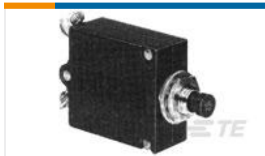
TE Part #6-1393246-7 W23-X1A1G-2=W23/W31