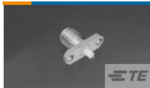
TE Part #1052926-1 2052 8002 92