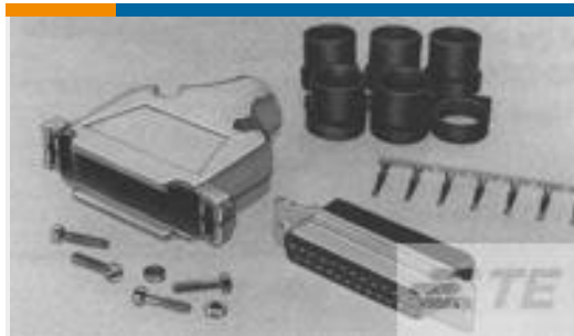
TE Part #749806-8 KIT, HDP-20, RCPT, SIZE 2, 15 PO