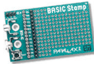
BS1-IC Carrier Board -- #27110

Both BASIC Stamp modules have corresponding carrier boards. These optional boards provide an easy means to program and prototype with the BASIC Stamp modules. The carrier boards provide the following items: prototyping area, 9-volt battery clips, I/O header, reset button, and programming connector. Separate carrier boards are available for the BS1-IC and BS2-IC.