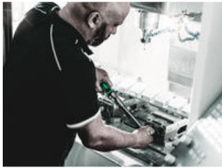
Click-Torque Wrench series