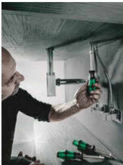
Hollow shaft for protruding threaded rods