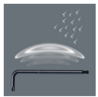
L-keys with BlackLaser surface treatment for outstanding surface protection and long service life. High corrosion protection.