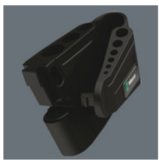
Wear-resistant clip material ensures secure storage of the Lkeys as well as simple removal

Wera - 967/9 TX 1 05024242001 - 4013288104946