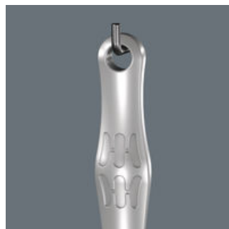
Joker 6004: Useful hole for hanging

Thanks to its hole the Joker can be neatly hung on the workshop wall.