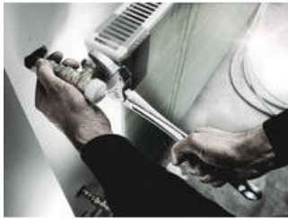
Joker 6004: Automatically and continuously self-setting