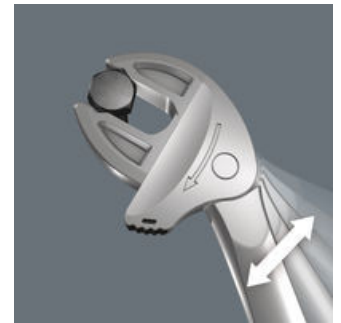
Joker 6004: Ratchet mechanism for fast work

The ratchet function in the mouth sees to fast and consistent screwdriving without removing the tool.