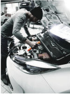
Zyklop ratchet and accessories for Electricians