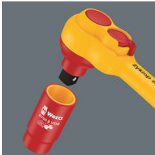
The ball lock ensures sockets and accessories are securely fitted, providing increased safety during operation. A short press on the release button allows the tool to be changed quickly.