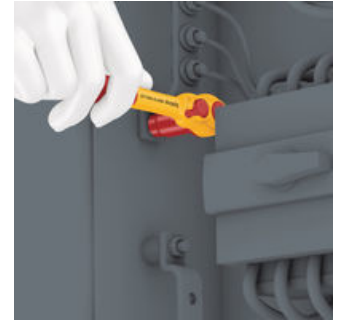
The extremely slim design of the Zyklop VDE ratchet makes it easy to work, even in confined spaces.