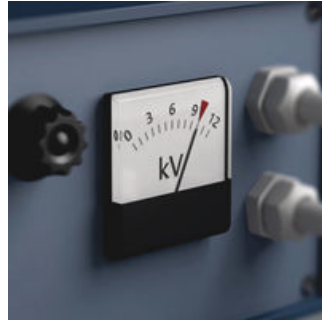
The individual testing of the Zyklop tools for electricians at 10,000 volts, in accordance with IEC 60900, guarantees safe working under voltages up to 1,000 volts.