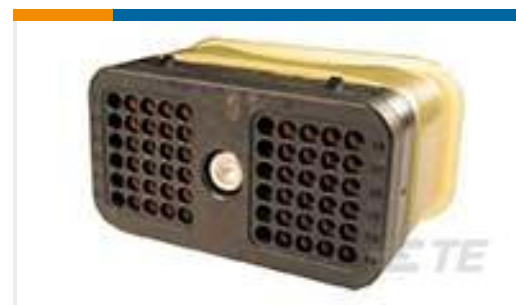
TE Part #DRC26-60S07 PLG, 60P, BLK, N, 07