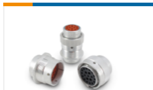
TE Part #HD36-24-23PE-059 DEUTSCH HD30 HOUSINGS