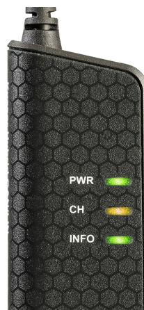
Figure 4: LEDs on the Kvaser Hybrid CAN/LIN.

The Kvaser Hybrid CAN/LIN has a single power LED as well as one traffic LED and one Informational LED for the CAN/LIN channel as shown in Figure 4 on Page 9. Their functions are described in Section 4.1, Definitions of LED states and colors, on Page 10.