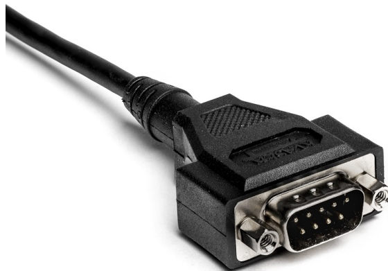
Figure 3: CAN/LIN connector on Kvaser Hybrid CAN/LIN

The Kvaser Hybrid CAN/LIN has one CAN/LIN channel in a 9-pin D-SUB CAN connector (see Figure 3). See Section 4.3, CAN/LIN connector, on Page 13 for pinout information.