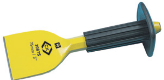
Brick bolster with grip