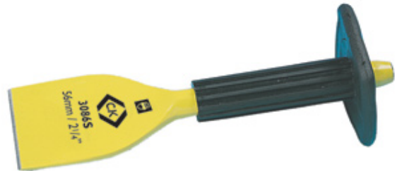
Electricians bolster with grip